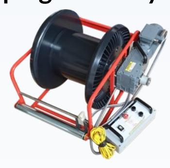
DRW-560S Electric winch Capacity 1750m/5750'